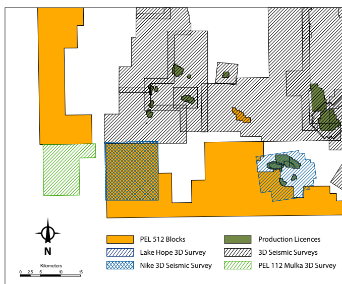
PEL 512 Seismic Map